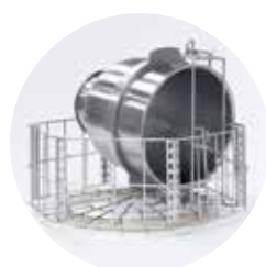
Pot holder for large pots