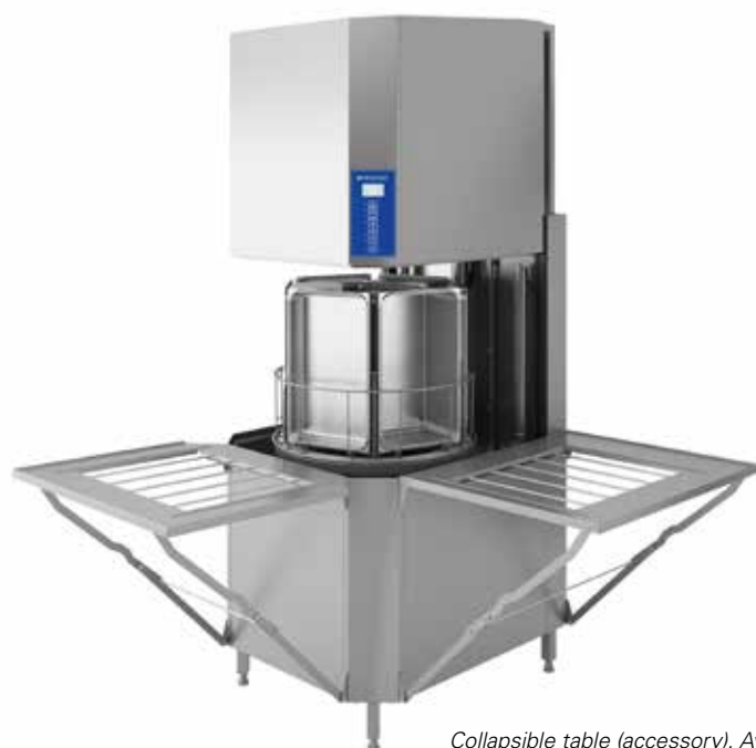
Collapsible table (accessory). Available for right, left and front installation.

One unique function offered by WD-90 DUO is spin cycles when potwashing. Dirty washing water is spun off before the rinse cycle, reducing the amount of clean rinsing water. Following the rinse cycle the dishes are spun a second time, which reduces the drying time.