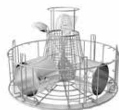
Saucepan support and ladle holder