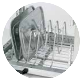
Upright support for containers

Below is a selection of accessories for different types of dishes. See the product sheet for more accessories.